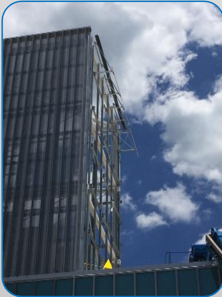
Solor Water Tube Install

The Tower work continues! Acitelli has almost completed the installation of the solar tubes on the South side of the tower. The manifolds are in, awaiting the installation of the glass tubes which should be completed by midweek.