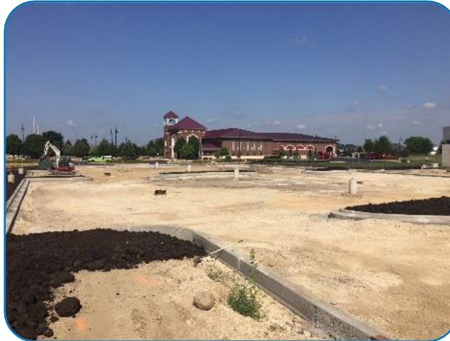
Main Parking Lot

Site work continues by Abbey Paving. The curbs for the main entrance parking area have been laid out and poured. Our parking lot, while larger than the Oswego Fire Station parking lot, is laid out very similar and follows the same parking design. One added feature is the pull up/drop off lane at the main entrance!