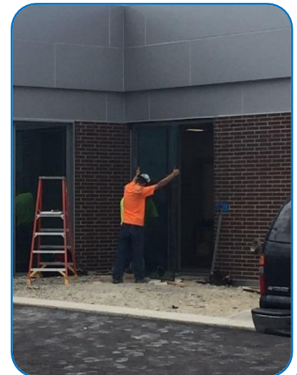
Holding Facility Entrance Door