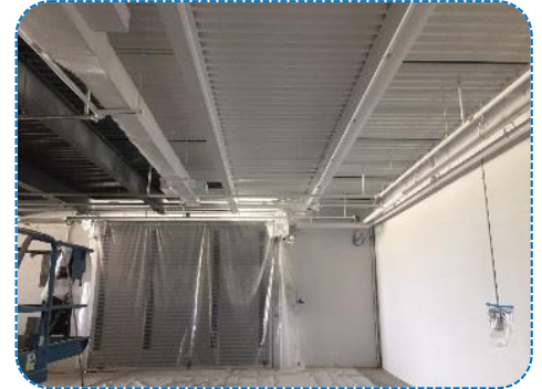
Sally Port Painting