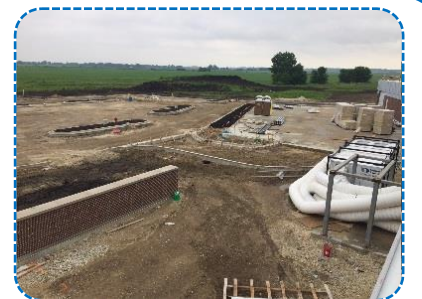
Curbing and drive that will lead to the parking garage where first line patrol vehicles will be kept.

The roof should be done in the next week or two!