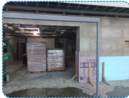
Beautiful Stone Wall – Lobby Area