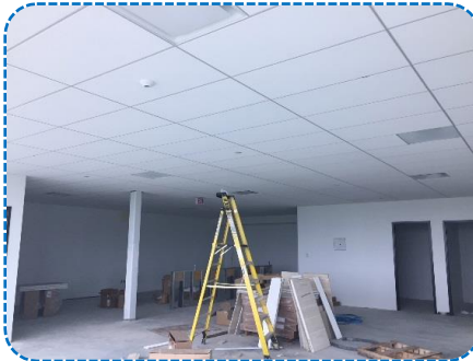
Ceiling tiles in Investigations Area

The inside of the building is changing every day! Once the light fixtures are installed, final painting and carpet installation will occur.