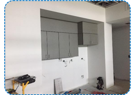
Investigations Break Area Cabinetry