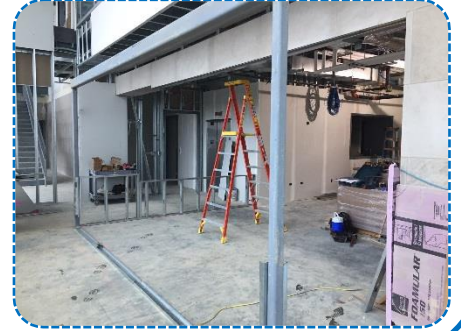
Front Counter Construction