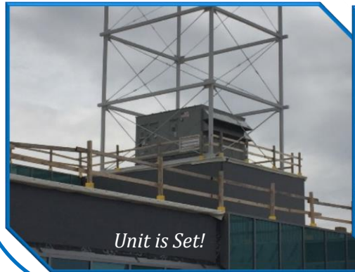
Unit is Set!