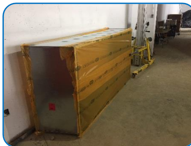
Range Mechanical Duct

Crews started installing the mechanical range duct work this week. This enormous size duct work will connect to the three 36" in diameter underground pipes and will pump clean air into the range.