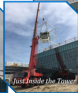
Just Inside the Tower