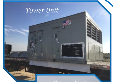
Tower Unit Installation