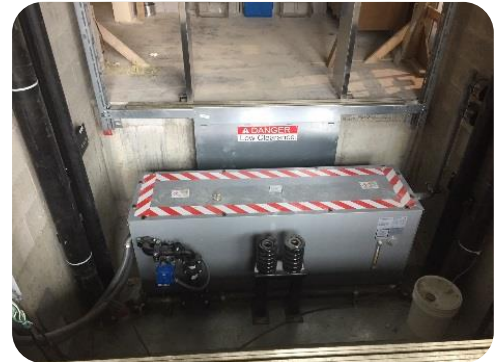
Elevator Oil Tank