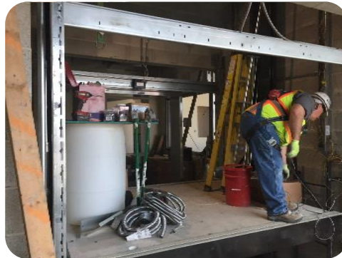
Elevator Floor Pad