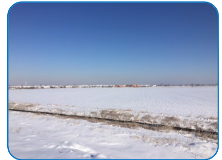
Top Right View from inside the building looking North.