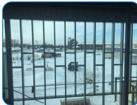
Bottom Right View from Records looking West into the lobby and front parking lot.