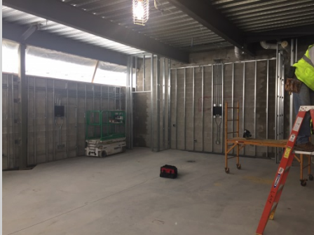
The first floor walls are being installed!

The training wing lobby, bathroom, emergency operations center and the fitness room walls are up. Shown above are the interior walls of the Emergency Operations Center.