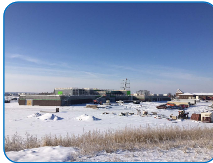
Top Left North side of the building.

For several weeks we have been showing you walls, roofs and mechanical units. This week we would like to share with you several different views from inside and outside of the building. Enjoy!