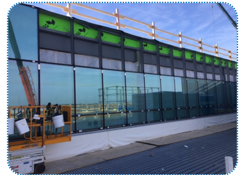
Alliance Glazing installed the second floor curtain wall and glass panels on the North side of the building this week.