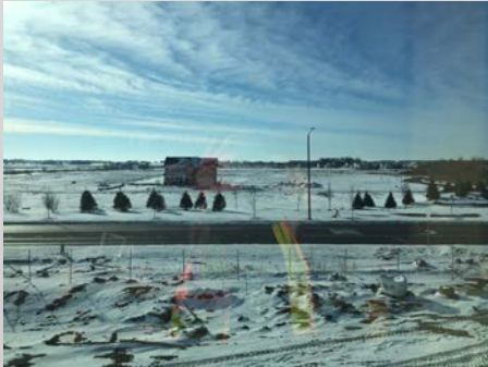
This picture was taken from the second floor Investigative Major Case room. How cool is this?!