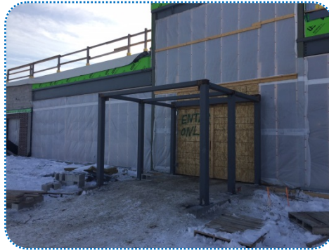
AREA Erectors completed the installation of the employee entrance vestibule. It will eventually be enclosed in glass.

This week we are going to focus on the exterior of the building. Crews have been working hard installing the curtain wall (glass), stone and roofing. They have battled extreme cold, sleet and snow to get the job done.