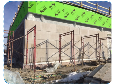
A.L.L. Masonry began installing the stone on the South Training Wing wall.