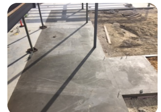
Lobby – Covered Heating