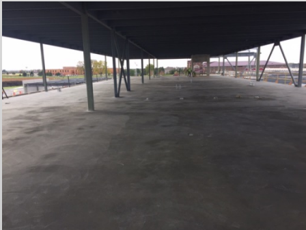
Second Floor – Finished Concrete Flooring