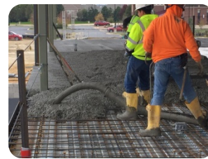
Concrete piped up through tubing