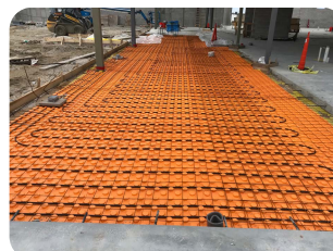
Lobby - Radiant Heating