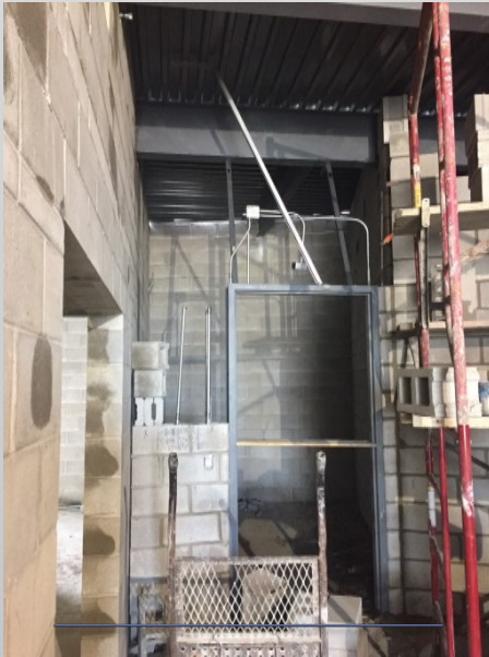
This is one of the interior vaults in the evidence room. Exterior brick work will begin next week.