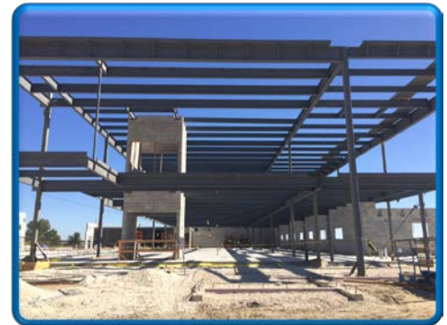
View from Front Lobby