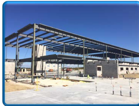
Community Room into Records

AREA Erectors have been working hard setting the steel support and I-beams for the second floor which will house Administration, Social Services and Investigations.