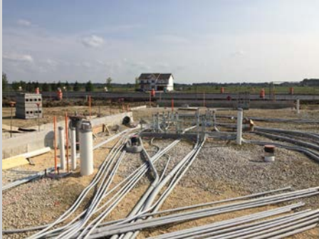
This picture shows the electrical and plumbing lines that will run under the concrete slab in the Records area.