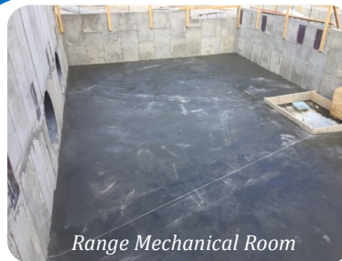
Range Mechanical Room