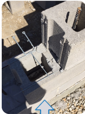
Wall construction consists of the concrete block filled with rebar and mortar.