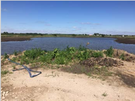
The recent rains filled up the borrow pit. Welcome to Lake Oswego!!